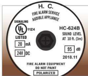
HC-624B 24 VDC