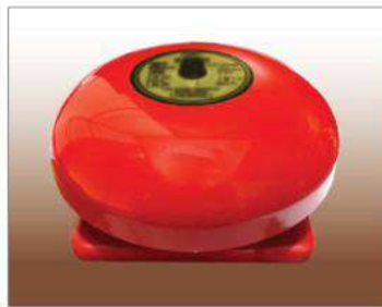
H. C. Ø6" Bell