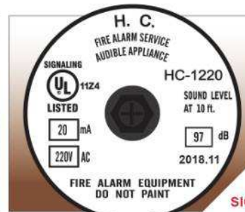
HC-1220 220 VAC