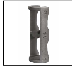
Model W4 Wrench