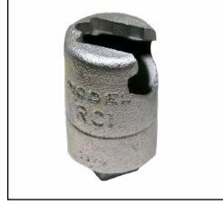
Model RC1 Wrench