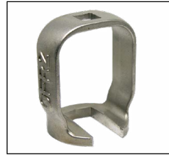
Model GFR2 Wrench