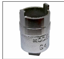
Model G4 Wrench