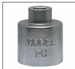
Model FC Wrench