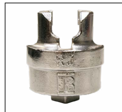
Model RJ Wrench