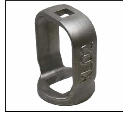
Model XLO2 Wrench