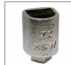
Model ZX-HSW Wrench