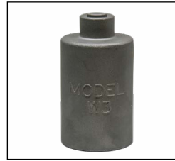
Model W3 Wrench