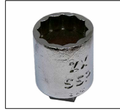
Model ZX Wrench