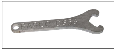
Model DS56 Wrench