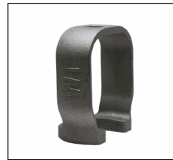
Model W1 Wrench