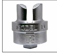
Model N Wrench