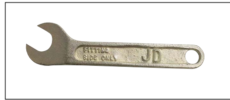
Model JD Wrench