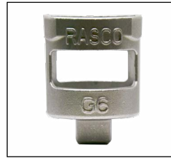
Model G6 Wrench