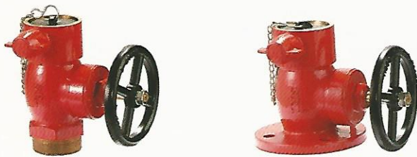
STRAIGHT THROUGH VALVE

CERTIFIED TO BS 5041:PT.1: 1987 Certification No: PS005706