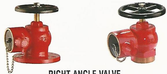
RIGHT ANGLE VALVE