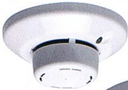
881 Ionization Detector