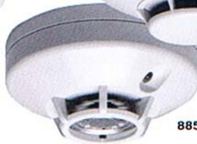
885 Heat Detector