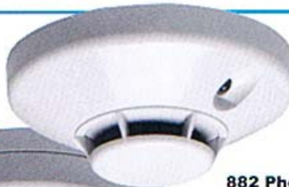
882 Photoelectronic Detector