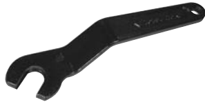
Model V27 Open End