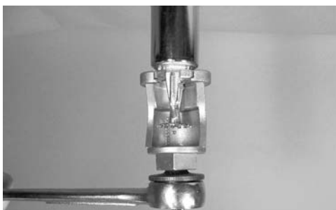
Correct Engagement for Model V36 Recessed Wrench