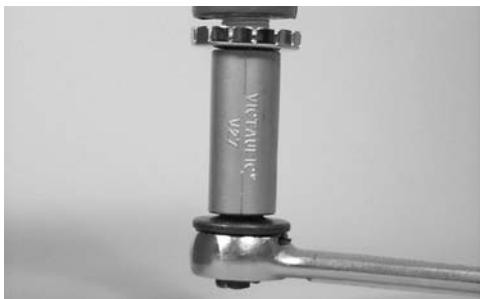
Correct Engagement for Model V27 Socket Wrench