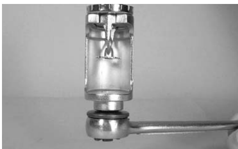
Correct Engagement for Model V34 and Model V38 Concealed/Recessed Wrench