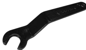
Models V34 & V36 Open End (used with Models V34 or V36 sprinklers)