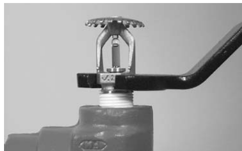
Correct Engagement for Model V27 and Model V34 Open-End Wrench