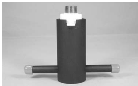
Correct Engagement for Model V29 Socket Wrench