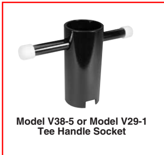
Model V38-5 or Model V29-1 Tee Handle Socket

Victaulic® provides a variety of wrenches to speed and ease sprinkler installation. Each wrench is designed to fit the particular sprinkler frame style identified. These wrenches should only be used for installation of the designated style sprinkler and no other type wrench should be used or warranty is void.