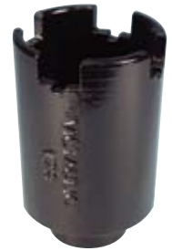
MODEL V29 CONCEALED