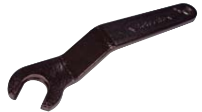
MODELS V34 & V36 OPEN END (USED WITH MODELS V34 OR V36 SPRINKLERS)