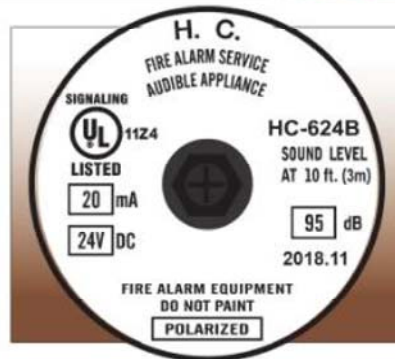
HC-624B 24 VDC