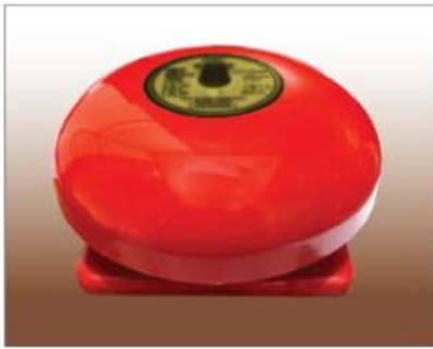
H. C. Ø6" Bell