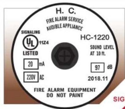
HC-1220 220 VAC