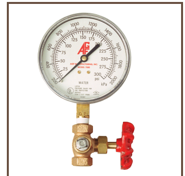
MODEL 7500 PRESSURE GAUGE WITH MODEL 7600 GLOBE VALVE

The AGF Manufacturing, Inc. Model 7600 1/4" 3-Way Globe Valve is an FM Approved/UL Listed valve designed to connect the pressure gauge to the sprinkler systems. The AGF Model 7600 has been designed to meet NFPA 13 System Attachments stating, "...each gauge shall be equipped with a shutoff valve and provision for drainage."