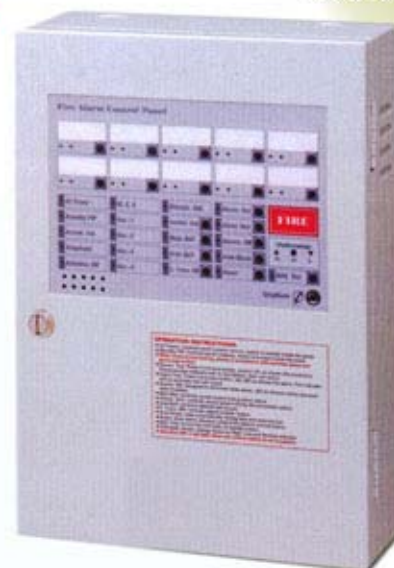
5 - 10 Zone